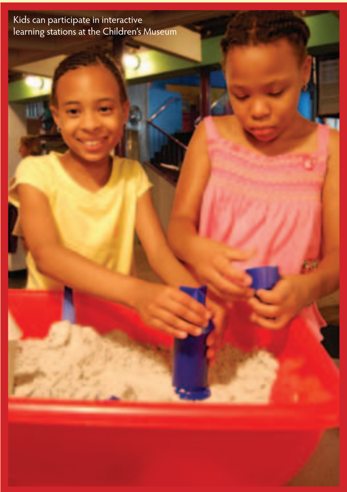
Kids can participate in interactive learning stations at the Children's Museum

Don't forget to tell them Sugar Land Magazine sent you!