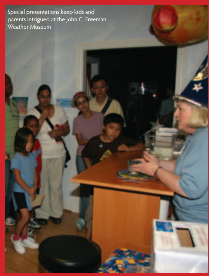
Special presentations keep kids and parents intrigued at the John C. Freeman Weather Museum