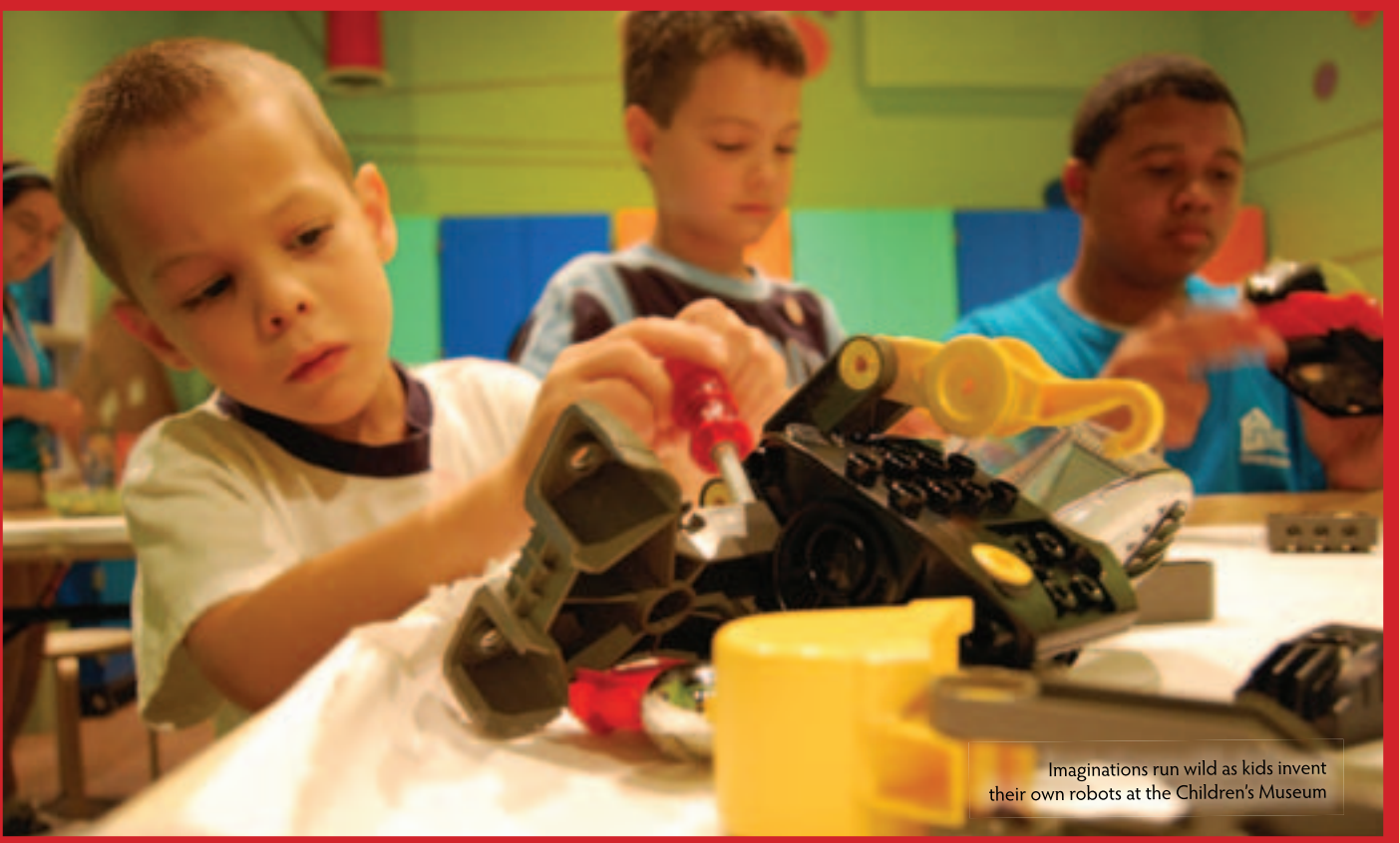
Imaginations run wild as kids invent their own robots at the Children's Museum