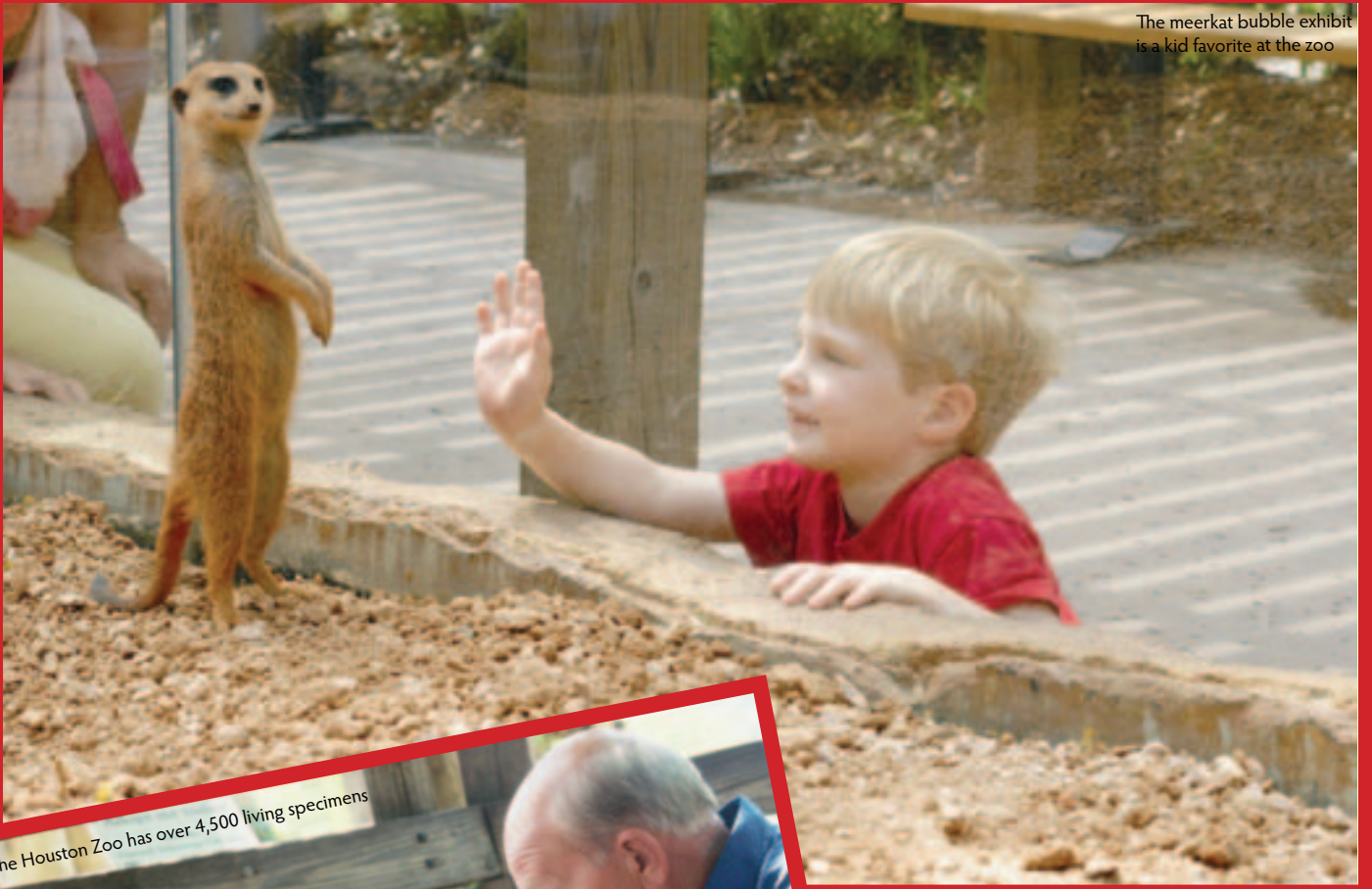
The Houston Zoo has over 4,500 living specimens