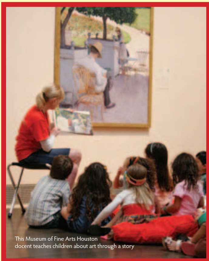
This Museum of Fine Arts Houston docent teaches children about art through a story