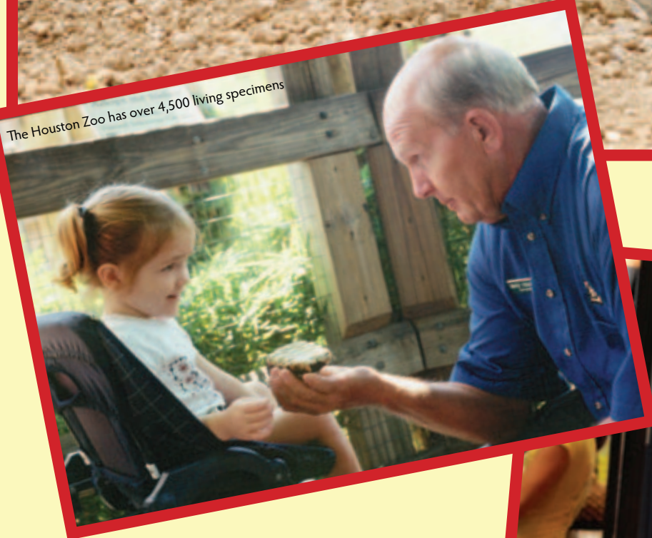
The Houston Zoo has over 4,500 living specimens